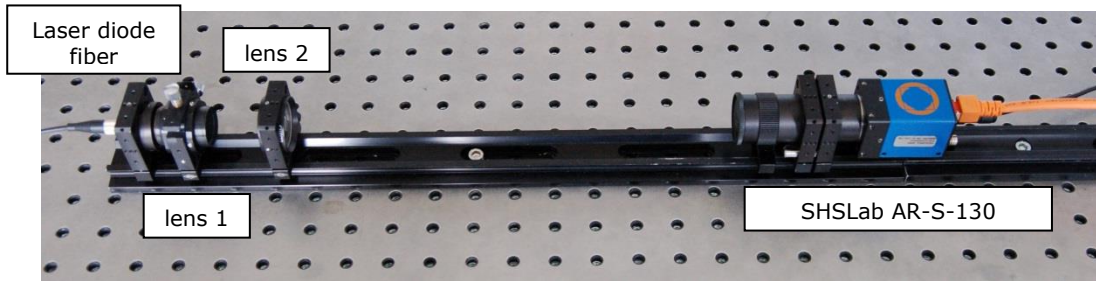
Figure 1: Experimental Setup

A diode laser with a wavelength of 635nm coupled to a single mode fiber is collimated by lens 1 (small focal length) and then focused by lens 2 (large focal length).